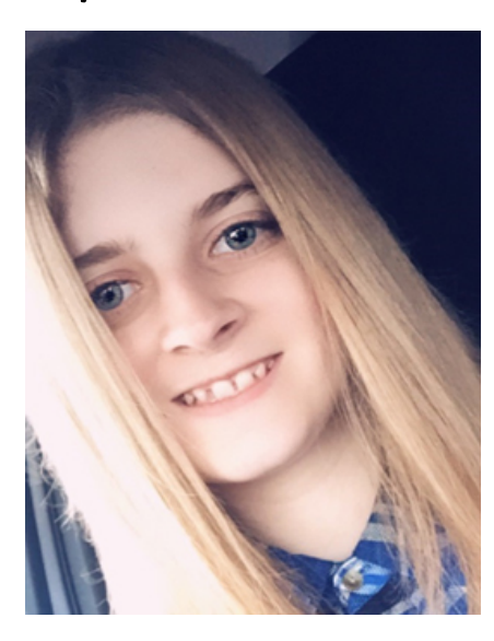
Become a positive role model and a math teacher of excellence ...